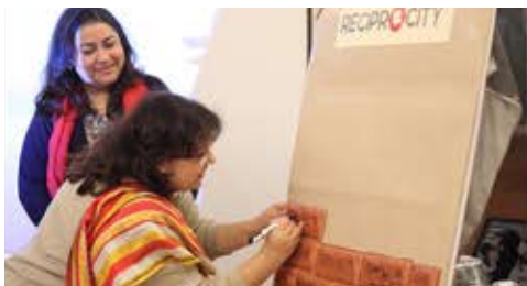
Building the Reciprocity wall