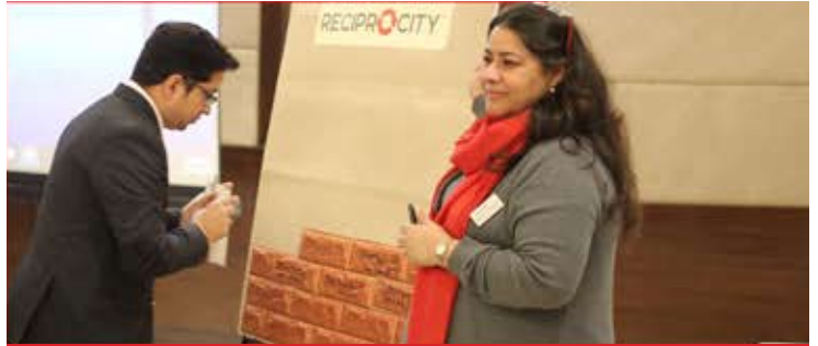
Building the Reciprocity wall