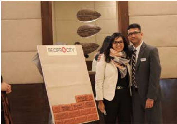
Build it brick by brick- Reciprocity wall