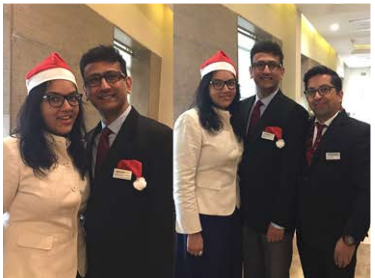
Celebrating the Christmas spirit