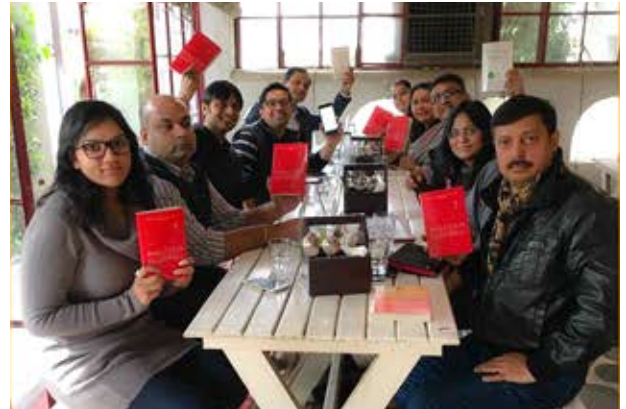
Reciprocity Book Club